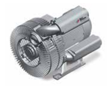
G-BH2 VELOCIS single, double and triple stage